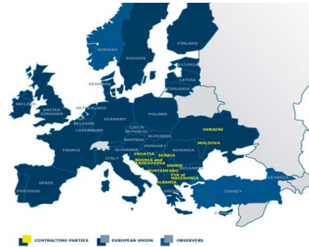
The Energy Community

The Contracting Parties have committed themselves to implement the relevant acquis communautaire on electricity, gas, renewables, environment and security of supply. In addition energy efficiency and new aspects of renewable energy are discussed.